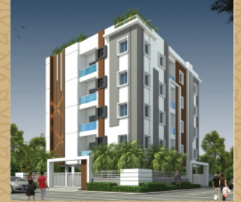
Exotica (Total 8 Flats) Karimnagar