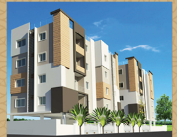
Tamara (Total 16 Flats) Karimnagar