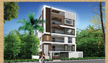
Fortune (Total 4 Flats) Karimnagar