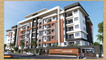
Aavaas (Total 75 Flats) Kompally