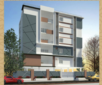
Flora (Total 5 Flats) Kompally